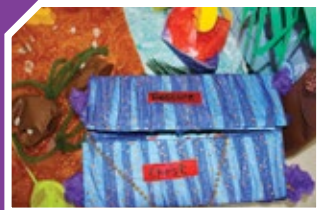
WARD 14 Display