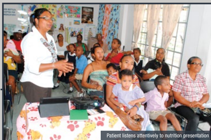
Patient listens attentively to nutrition presentation

The objective of this health promotion activity was to get the children "Moving for Health" and to educate them on the importance of healthy lifestyle practices in order to prevent the rise of communicable diseases among our young generation.