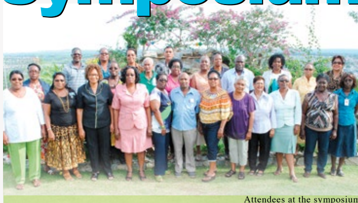
Attendees at the symposium

There were also presentations, from Maritime Limited, Guardian Life Holdings Limited, the Trinidad and Tobago Association for Retired Persons (TTARP), National Insurance Board (NIB) among others and displays from the Craftsman's Forum.